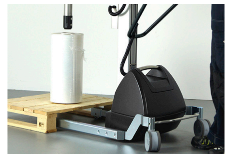
TAWI Lifting Trolleys

On several models, the measures of the wheels make it possible to drive the lifter into a Euro-pallet in three different ways.