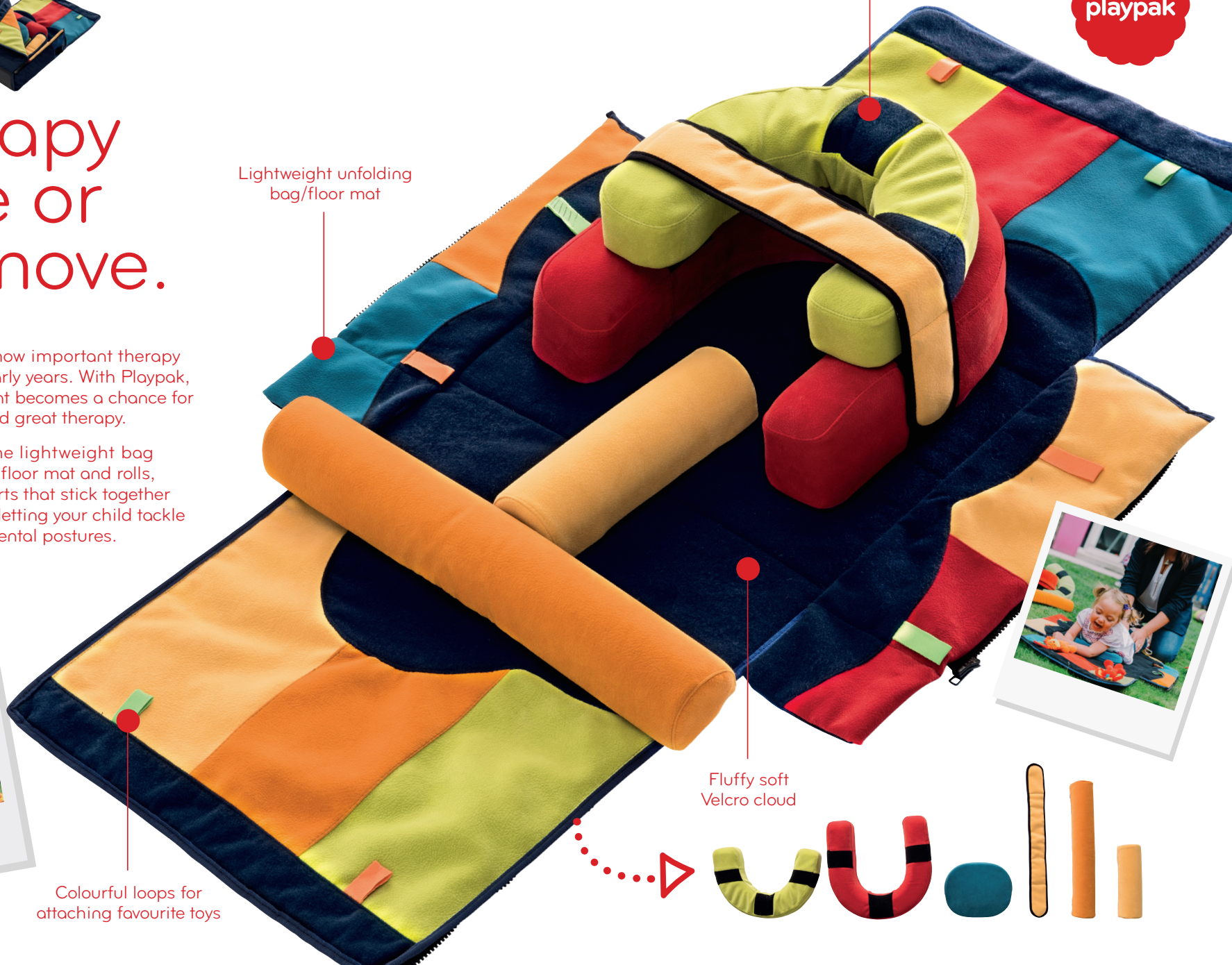
Fluffy soft Velcro cloud