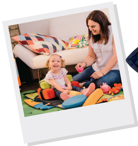
Colourful loops for attaching favourite toys

Once unzipped, the lightweight bag reveals a colourful floor mat and rolls, wedges and supports that stick together in dozens of ways, letting your child tackle different developmental postures.