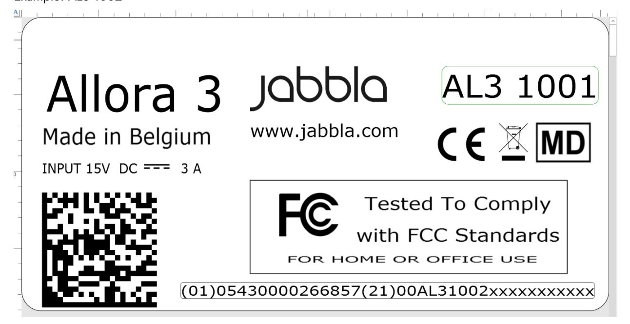
Figure 8: Allora 3 type plate

You will find the label with the serial number of the device on the rear panel of the device. Example: AL3 1002