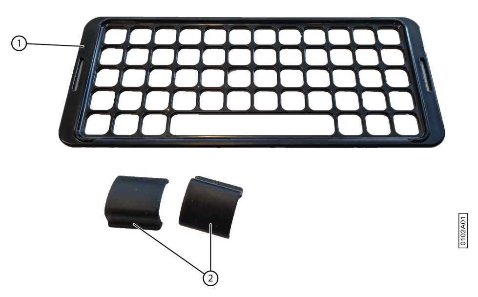
Figure 4: Keyguard and clips