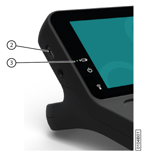
Figure 6: Connection for charging the device

It is preferable to charge the device at room temperature (about 20 °C / 68 °F). Temperatures lower than 5 °C (41 °F) and higher than 45 °C (113 °F) may adversely affect the battery.