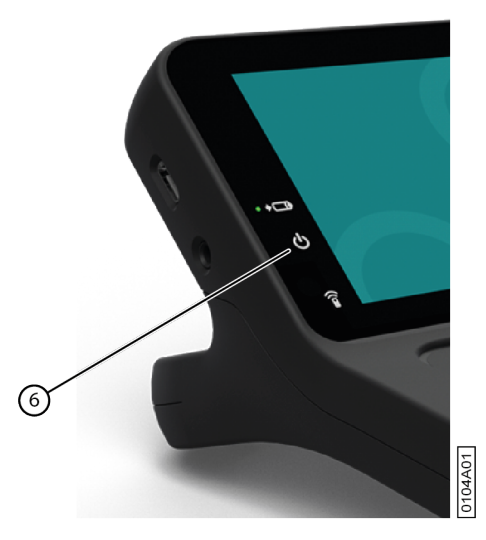
Figure 7: Viewing the power status