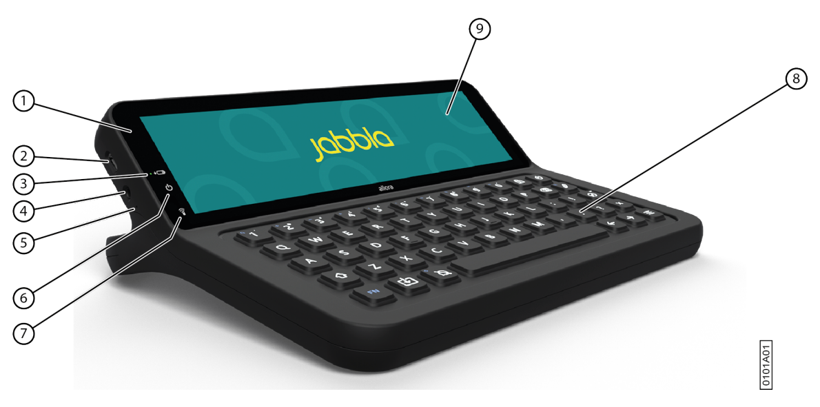
Figure 2: Front view