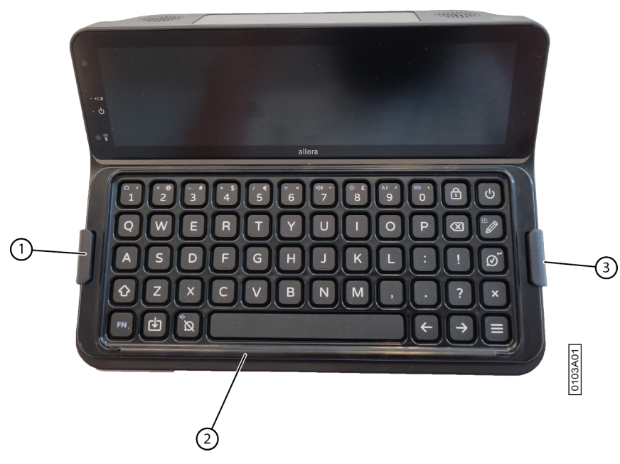
Figure 5: Fitting the keyguard