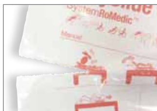
Perforated at 50-cm intervals; just unroll and tear off the desired length.