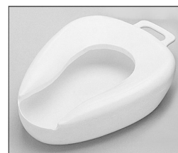
No. 640 Bed Pan