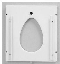
SA154 Seat Assembly