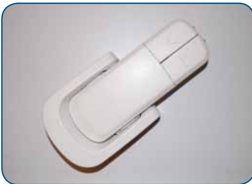
Fig. 2.2: call and send station

The call and send stations will not function when the cover is placed over the seat.