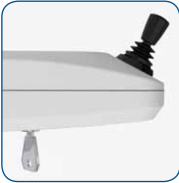
Fig. 2.1: control unit with keyswitch