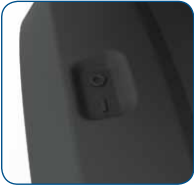
Fig. 2.3: main switch

It is recommended that you switch the chairlift off if you will not be using it for a period of more than two weeks.