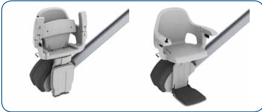
Fig. 2.4: Folded and unfolded chair

The chairlift can be folded up when parked.